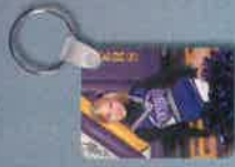
2-Sided Metal Key Chain (no personalization)