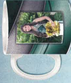
Ceramic Mug (Image wraps around mug)