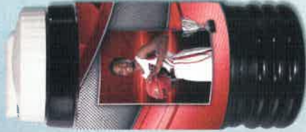
Plastic Water Bottle (Image wraps around bottle)