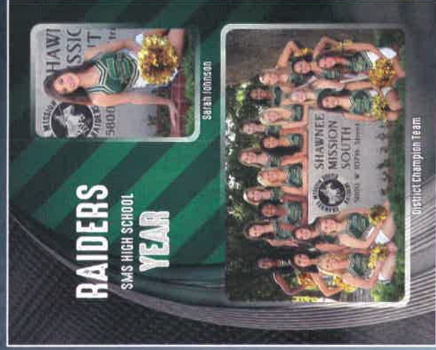
Traditional Memory Mate