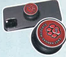
Pop Socket with Your School Logo