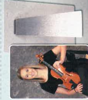
4x6 Metal Desk Print (no personalization)