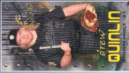
2'x4' Sports Banner