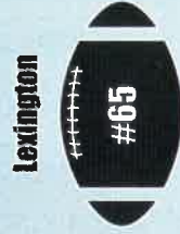
Brandon Window Decal